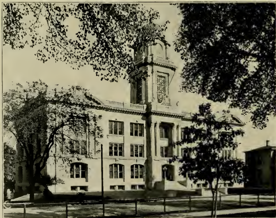
NEW CITY HALL